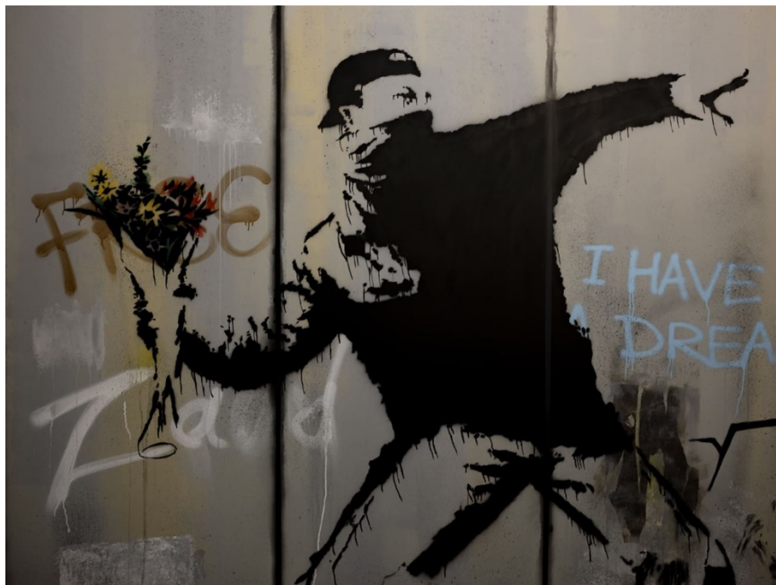
Love is in the air, Banksy

The exhibition highlights the artist's irony and provocative nature. We can sense the irony and provocation in his creations but we are also touched by his sensitivity when he tackles difficult subjects such as childhood victims of war, migrants, poverty, like his art piece Love is in the air . It is painted on the concrete barrier that separates Israel from Palestine in the middle of Jerusalem, and depicts a young man throwing flowers instead of a missile, in the same way as during a violent intifada, when demonstrators throw stones at the armed forces with their faces hooded. Banksy seems to be saying "let's throw flowers" instead of stones.